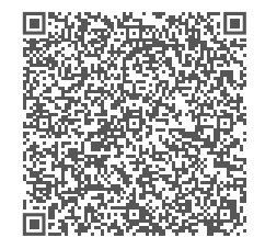
Soneva Jani Resort Map

Future plans for Soneva Jani include a state of the art children's club (The Den) and turtle sanctuary.